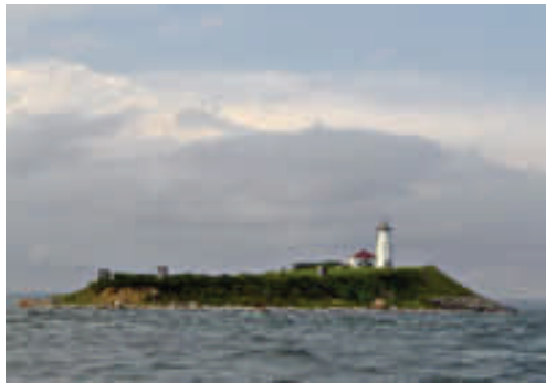
Beautiful Faulkner's Island is 3.5 miles offshore