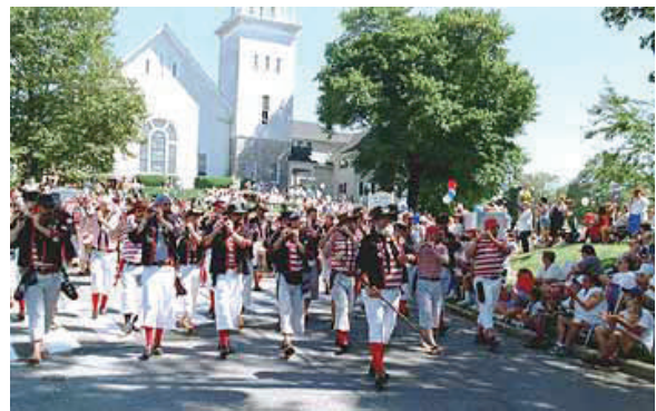
The Ancient Mariners Fife & Drum Corps

The Mariners play and sing a variety of traditional music, from up-tempo hornpipes and jigs to the work songs used on board ships, as their way of telling the story of Colonial seamen. This Fife & Drum Corps was founded in 1959.